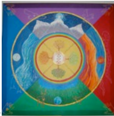
The Tree of Life at the Center of the World

You can order his film there if you wish. This film is guaranteed to astound & to offer you hope for the future as well as a sense that we may not be as alone as we often feel. The inspiration & beauty of mystery is great here!